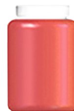
WIDE CONTAINER SLEEVE